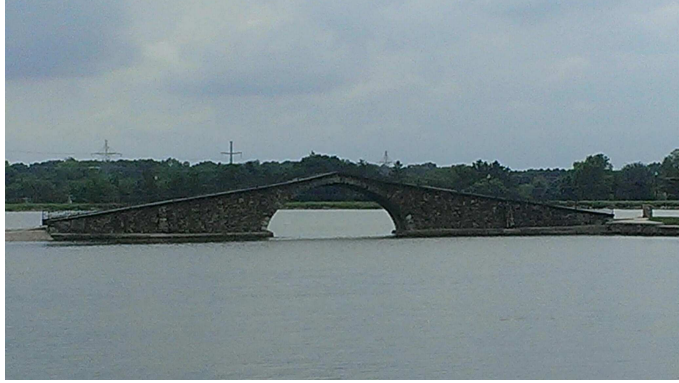
Figure 6. The Pedestrian Bridge

Appearing much like a sculptural work of art, the large metal structure that sits to the south of the pavilion was once the framework for the courthouse dome (fig. 7). After being brought to the park, the dome was originally encased in wire mesh and used as an animal cage before eventually being used in its present manner as object d'art and historic artifact (McLean County Museum of History: Miller Park Archives). There is a plaque in place that explains the origins and history of the dome, near its base. It is an element of contrast against the rolling lawn on which it sits, with the lake as its backdrop (observation notes 2013).