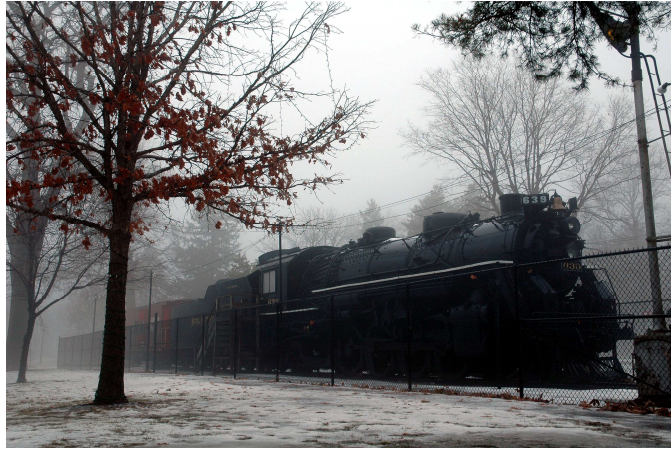
Figure 10. The Nickel Plate Railroad

whistle that was once used in Bloomington's trainyards; with a plaque commemorating its use and its dedication by local labor unions on Labor Day 1982. The train and steam whistle, appear as reminders of a previous time in American history, specimens of earlier culture and of curiosity to children and adults alike (observation notes 2013).