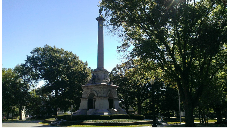
Figure 2. The Soldiers and Sailors Monument