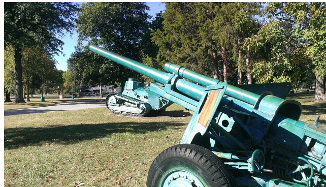
Figure 3. World Wars I and II War Implements

The World Wars I and II war implements, (fig. 3) parked along the Wood street border near its central entrance, act as monuments to the wars and again to those soldiers who fought and served during those wars. The guns appear as a physical reminder of war but do not give the feeling of memorial or somber reflection found at the other two war monuments within the park (observation notes 2013). Unlike the other memorials within the park, there is no list of names of the war dead near these implements, which include an artillery canon and two different types of tank vehicles. A plaque that had once been affixed to one of the guns is now missing, likely due to theft or vandalism (observation notes 2013).