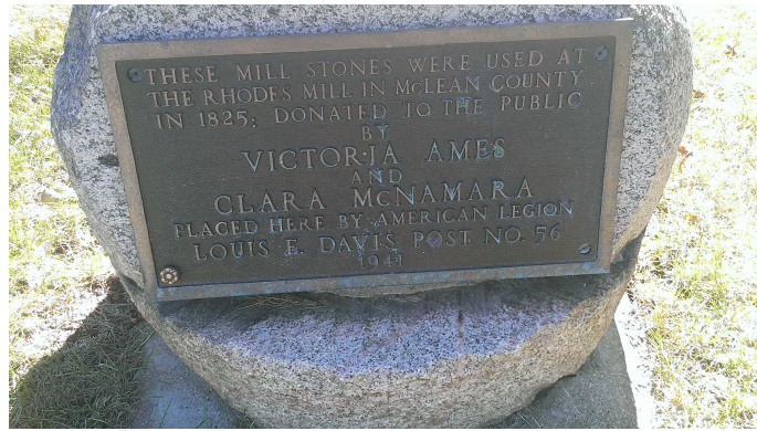
Figure 8. Rhodes Mill Stones