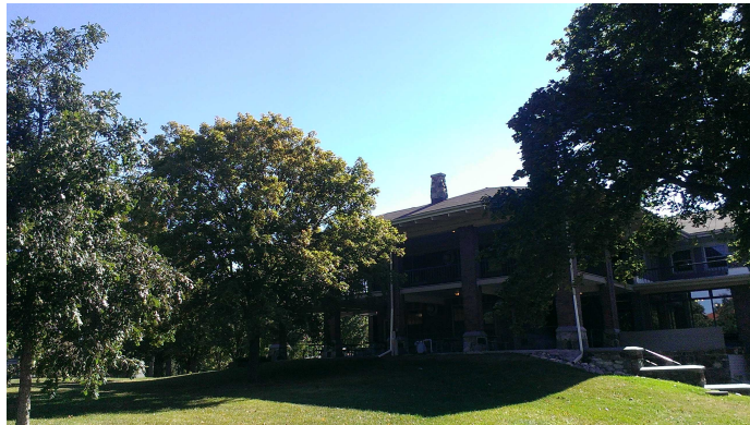
Figure 9. Miller Park Pavilion

the years, at more than 100 years old, it still appears much as it did in its original form (Proeber 2006). The pavilion has been the location for numerous cultural events throughout its history, including band performances, cotillions, and dances (cityblm.org). Recent cultural events within the pavilion have included a spaghetti dinner, orchestral performances, and a Christmas celebration. Among it's current uses, the pavilion serves as an election day polling location, hosts yoga classes, parties, receptions, community meetings, and houses a senior citizen center with outreach and recreation programs in the basement (cityblm.org).