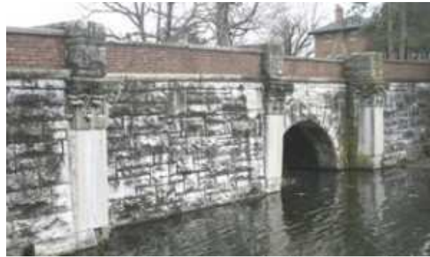
Figure 5. The Summit Street Bridge

At the far eastern edge of the lake, the water drains to an area running beneath Summit Street (observation notes 2013). The Summit Street Bridge (fig. 5) is of stone construction, with multiple classical columns in place that were once part of the courthouse entryway. Salvaged after the courthouse fire (Steinbrecher-Kemp 2007), the columns were employed in the construction of the bridge, and are easily visible when viewing the bridge from its western aspect (observation notes 2013).