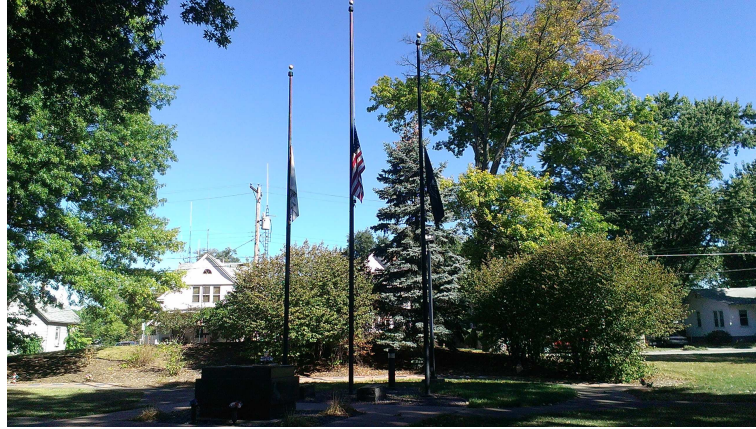
Figure 4. The Korea and Vietnam Wars Memorial

The area is shaded with large trees, and there are benches present near the headstones, which allow for rest and contemplation within the memorial garden. These wars being the most recent of wars honored within the park, there are names depicted here of people who likely have living relatives, and I observe flowers placed near a headstone as a traditional act of remembrance (observation notes 2013). The flags here are illuminated at nighttime, and are sometimes flown at half-mast, as another traditional form of reverence or remembrance (observation notes 2013).