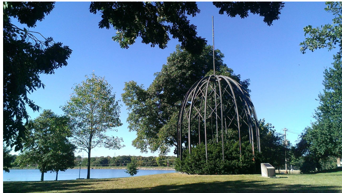
Figure 7. The Courthouse Dome

Appearing much like a sculptural work of art, the large metal structure that sits to the south of the pavilion was once the framework for the courthouse dome (fig. 7). After being brought to the park, the dome was originally encased in wire mesh and used as an animal cage before eventually being used in its present manner as object d'art and historic artifact (McLean County Museum of History: Miller Park Archives). There is a plaque in place that explains the origins and history of the dome, near its base. It is an element of contrast against the rolling lawn on which it sits, with the lake as its backdrop (observation notes 2013).